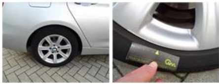
Alloy rim F L, Scratch(es), LI - Repair and paint (complete)