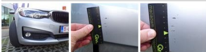
Door F L, Dent(s) and scratch(es), LI - Repair and paint (complete)