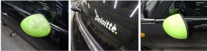
Wing R L, Scratch(es), LI - Repair and paint (complete)