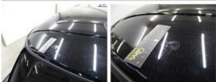
Tailgate, Scratch(es), 67 - Polish