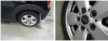
Bodywork, Glue residues, Acceptable