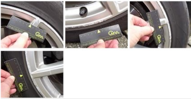
Alloy rim F L polished, Scratch(es), LI - Repair and paint (complete)