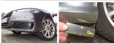
Door F L, Repaired, P - Check