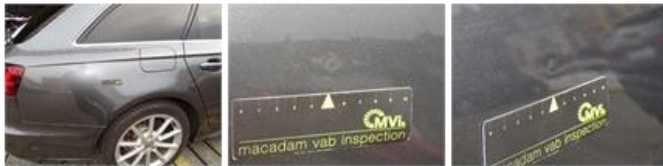
Alloy rim R R polished, Scratch(es), LI - Repair and paint (complete)