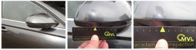
Door R L, Repaired, P - Check