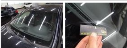
Bodywork, Glue residues, Acceptable