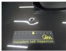
Engine protective plate, Hole, E - Replace