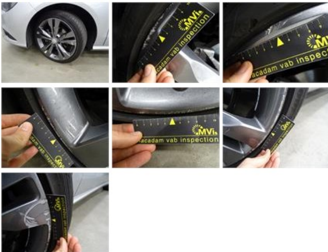
Alloy rim R L, Scratch(es), Acceptable