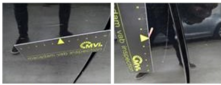
Wing R R, Dent(s) and scratch(es), LI - Repair and paint (complete)