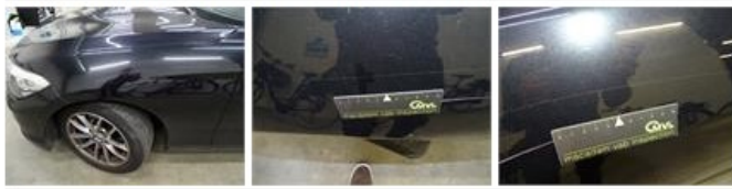
Alloy rim R R, Scratch(es), LI - Repair and paint (complete)