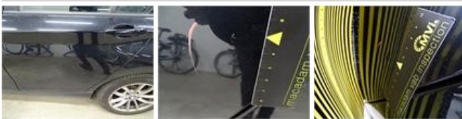
Alloy rim F L, Scratch(es), LI - Repair and paint (complete)