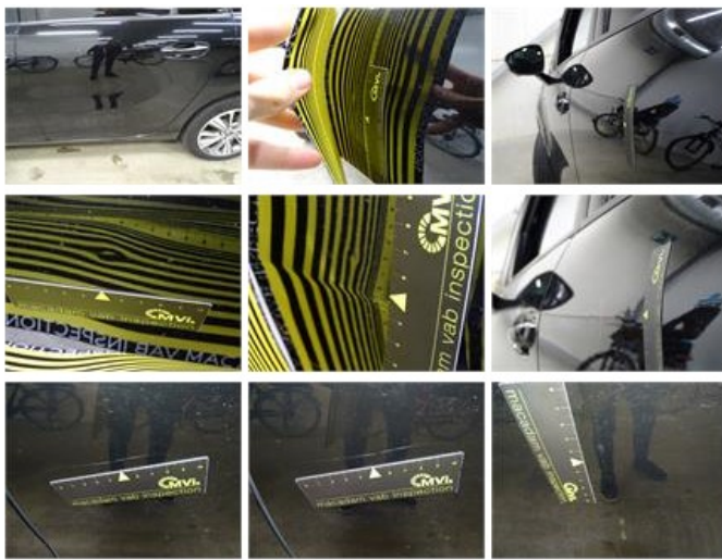
Door R R, Dent(s) and scratch(es), LI - Repair and paint (complete)