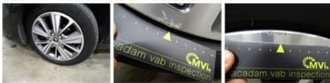
Door F L, Dent(s) and scratch(es), Acceptable