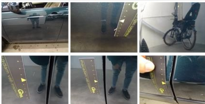
Alloy rim F R, Scratch(es), LI - Repair and paint (complete)