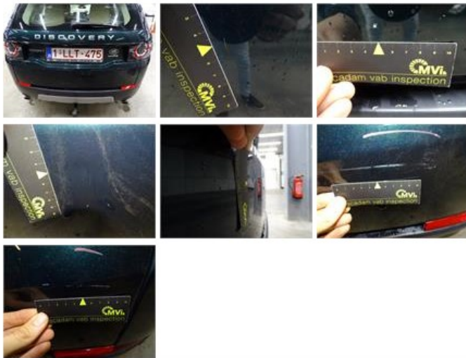
Wing R L, Scratch(es), Acceptable