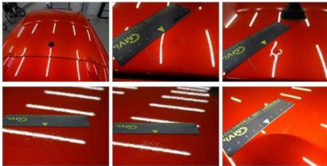
Wing F R, Chemical pollution, 67 - Polish