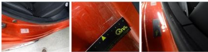
Door R L, Repaired, Acceptable