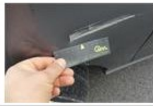
Door F L, Scratch(es), LI - Repair and paint (complete)