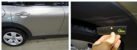
Wing F L, Scratch(es), Acceptable