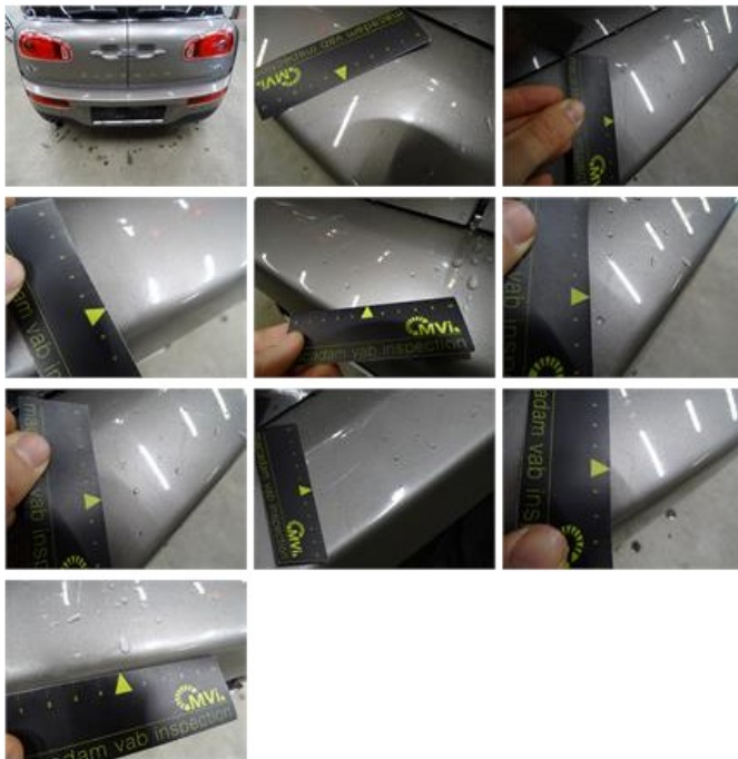
Boot cover, Missing, E - Replace