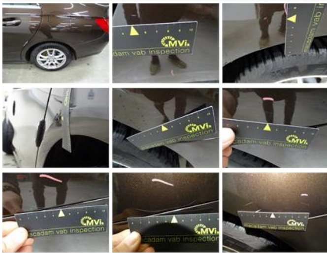
Backrest cover F R, Scratch(es), Acceptable