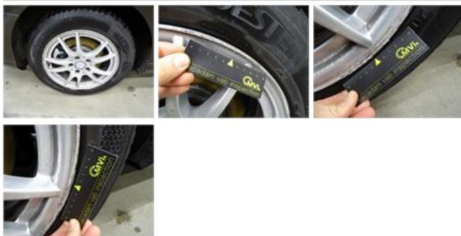
Wing F L, Dent(s) and scratch(es), LI - Repair and paint (complete)