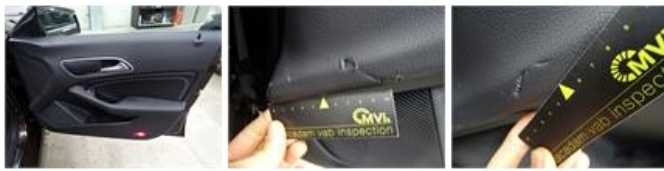
Door R R, Scratch(es), Acceptable