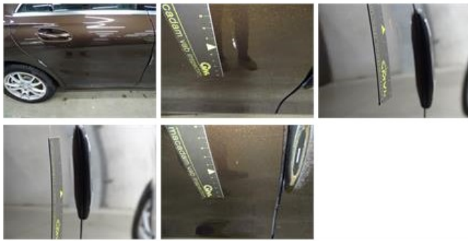
Door F L, Not original part, P - Check