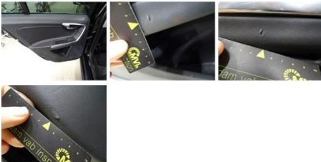
Rocker panel inner R L, Scratch(es), Acceptable