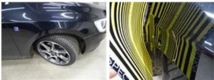
Bonnet, Scratch(es), Acceptable