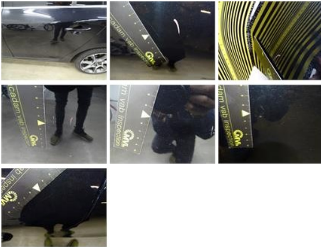
Wing F R, Dent(s), PDR - Paintless dent repair