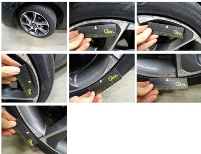
Alloy rim R L polished, Scratch(es), LI - Repair and paint (complete)