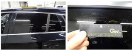
Door R L, Dent(s) and scratch(es), LI - Repair and paint (complete)