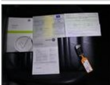
Interior, Not original part, P - Check