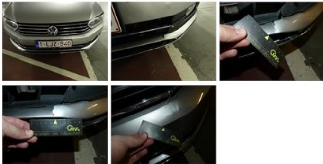
Bumper grille F L, Broken, E - Replace