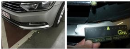
Grill, Broken, E - Replace