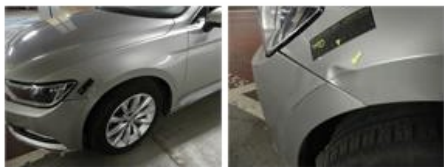
Wing R L, Dent(s), Acceptable