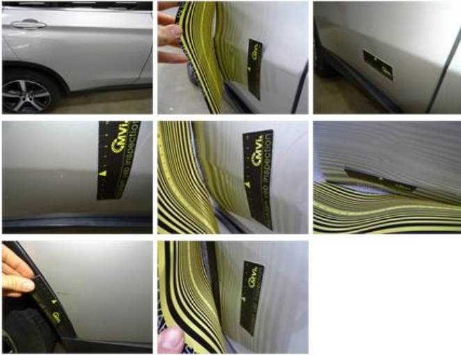
Door panel R L, Tear, E - Replace