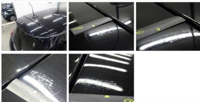
Wing R L, Dent(s) and scratch(es), LI - Repair and paint (complete)