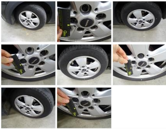
Wing R R, Scratch(es), LI - Repair and paint (complete)