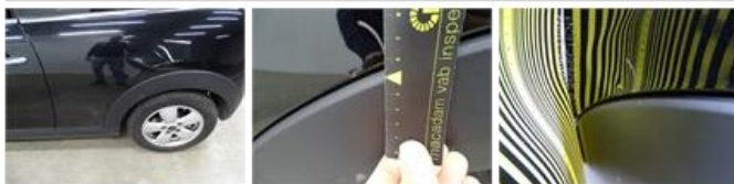
Wing trim R L, Scratch(es), Acceptable