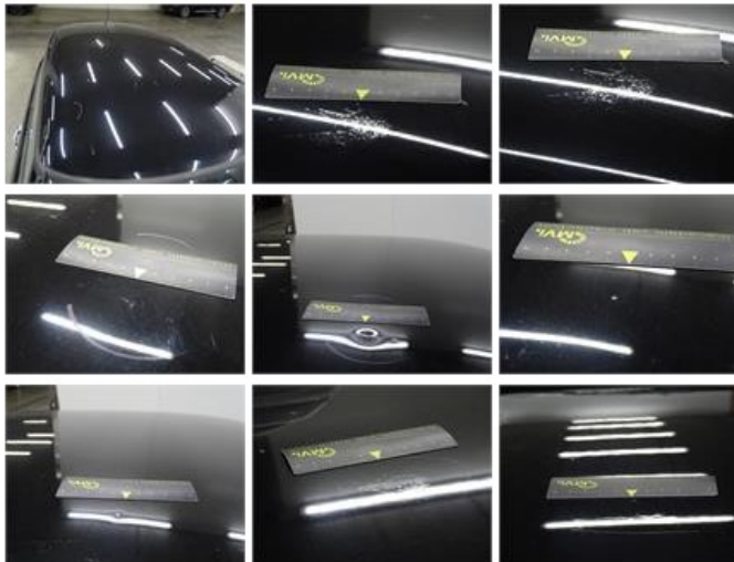
Aerial, Broken, E - Replace