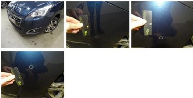
Door R L, Scratch(es), Acceptable