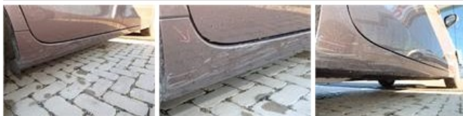
Rocker panel inner R R, Dent(s), LI - Repair and paint (complete)