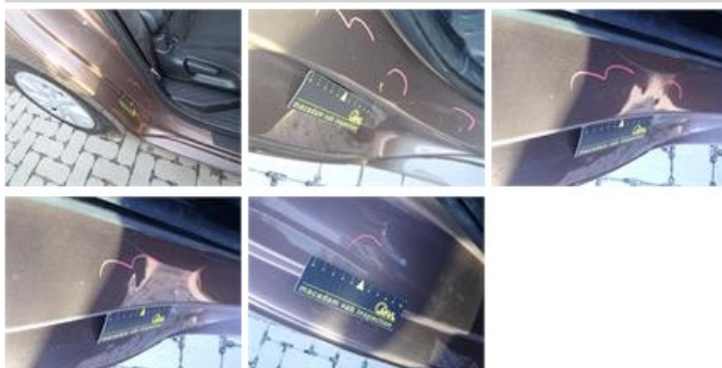
Door F R, Scratch(es), Acceptable