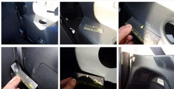
Sill outer R, Dent(s) and scratch(es), LI - Repair and paint (complete)