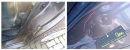
Front end, Scratch(es), It - Spot repair