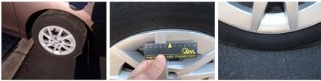
Wheel cover R R, Scratch(es), E - Replace