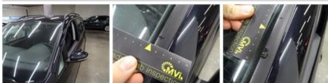
Door R R, Dent(s) and scratch(es), LI - Repair and paint (complete)