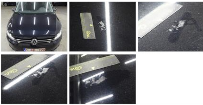
Rearview mirror housing R, Scratch(es), Acceptable 0,00