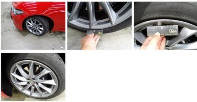
Alloy rim R R, Scratch(es), E - Replace 277,44