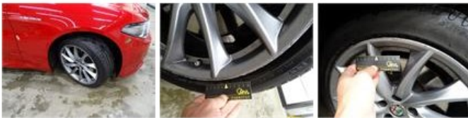
Alloy rim R L, Scratch(es), LI - Repair and paint (complete) 95,00