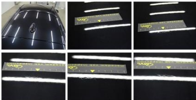
Wing R L, Scratch(es), 67 - Polish