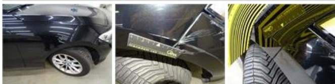
Door panel R L, Scratch(es), Smart repair