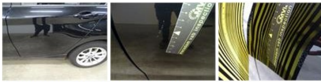
Alloy rim F R, Scratch(es), LI - Repair and paint (complete)