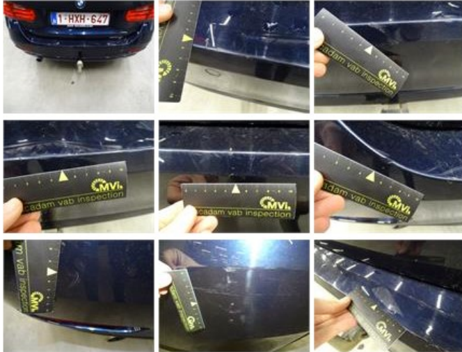
Wing R L, Dent(s) and scratch(es), LI - Repair and paint (complete)