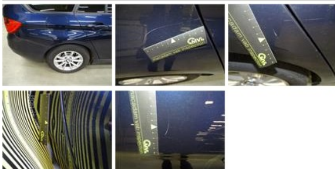
Door F R, Dent(s) and scratch(es), LI - Repair and paint (complete)