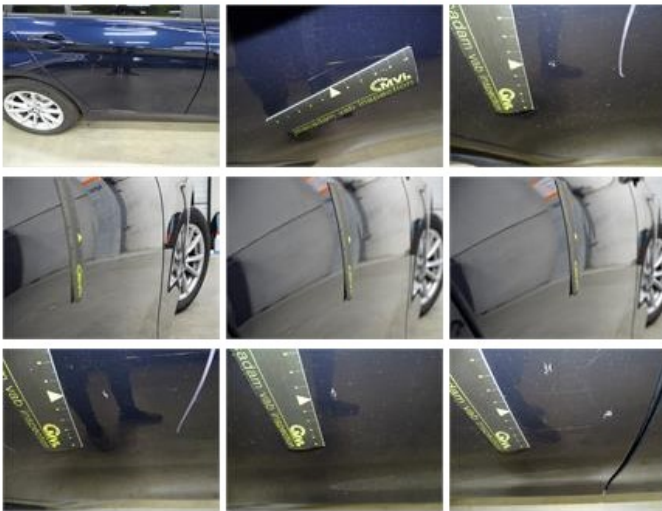
Rocker panel inner R L, Dent(s), LI - Repair and paint (complete) 115,56