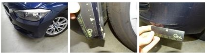
Door R R, Dent(s) and scratch(es), LI - Repair and paint (complete) 318,35