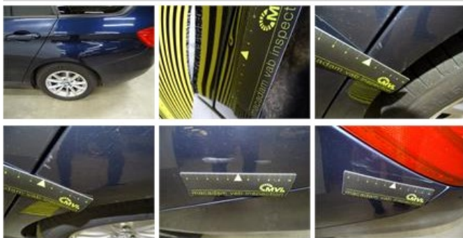
Door panel R R, Tear, E - Replace