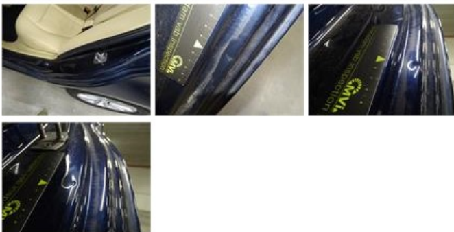
Seat cover F L, Worn, Acceptable 0,00