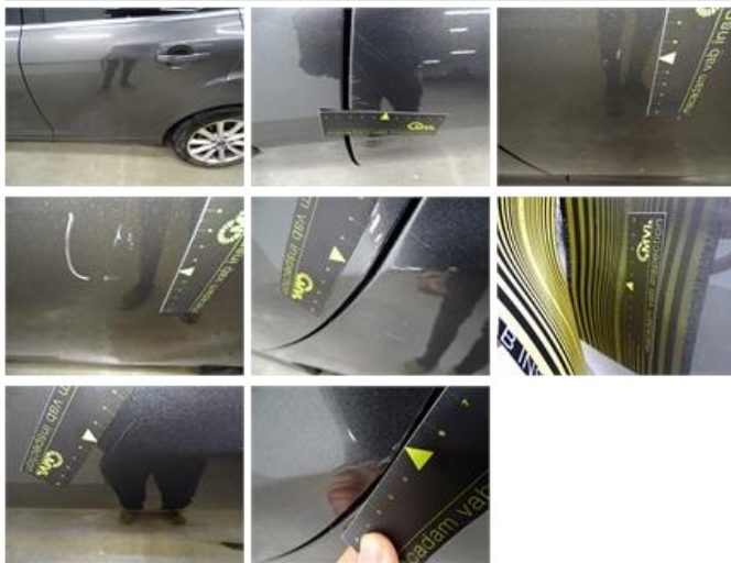
Bumper corner R L, Scratch(es), Acceptable