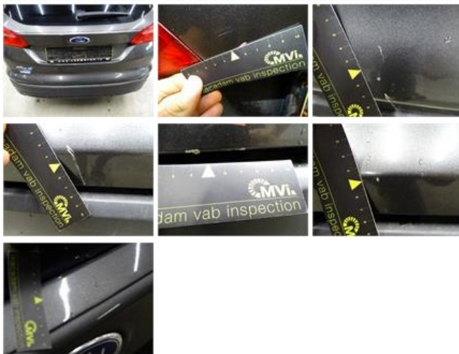
Roof, Chemical pollution, LI - Repair and paint (complete)