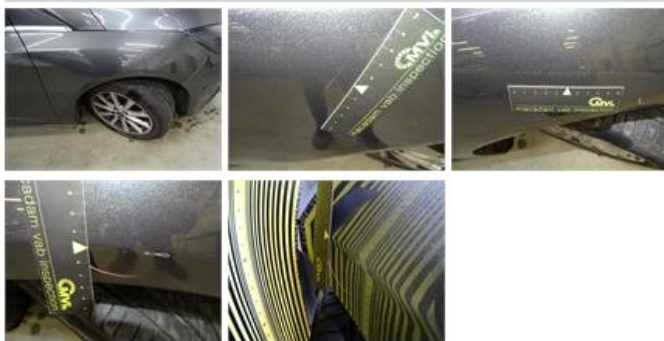
Door F L, Dent(s) and scratch(es), LI - Repair and paint (complete)