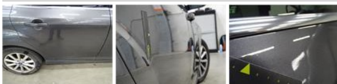
Wing R L, Dent(s) and scratch(es), LI - Repair and paint (complete)