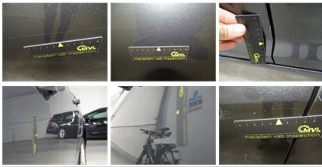
Trunk lid covering R, Scratch(es), Smart repair