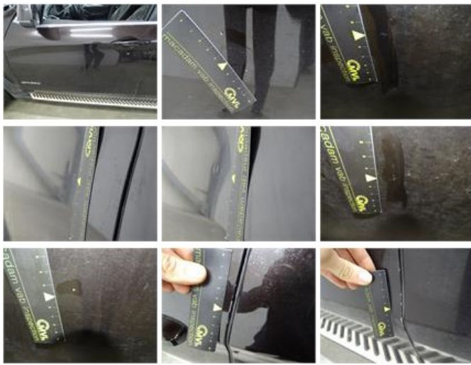
Bonnet, Dent(s), PDR - Paintless dent repair