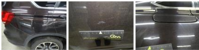
Tailgate, Scratch(es), LI - Repair and paint (complete)