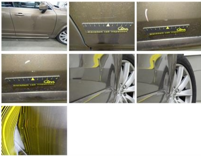
Alloy rim F R, Scratch(es), LI - Repair and paint (complete)