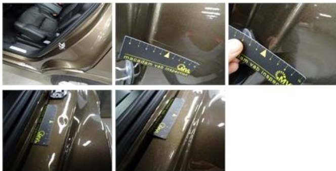
Wing F R, Scratch(es), Acceptable