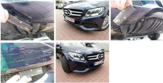
Wing R R, Dent(s), Acceptable