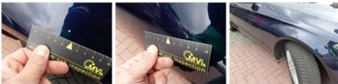
Wing R R, Repaired, P - Check