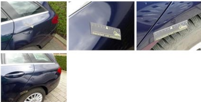
Wing F R, Scratch(es), Acceptable