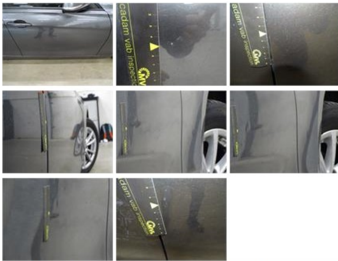
Wing F R, Dent(s) and scratch(es), LI - Repair and paint (complete)