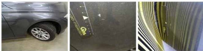
Alloy rim F L, Scratch(es), LI - Repair and paint (complete)