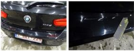
Bonnet, Chemical polution, LI - Repair and paint (complete)