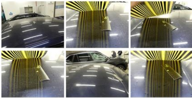
Wing R R, Dent(s), Acceptable