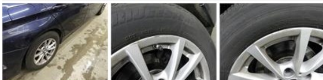
Alloy rim F R, Scratch(es), I - Repair