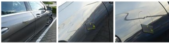
Roof pillar R, Dent(s), PDR - Paintless dent repair