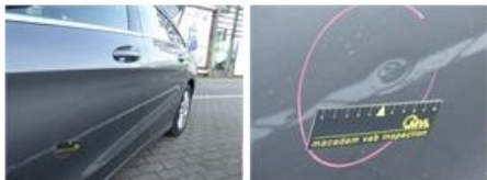
Bumper R, Scratch(es), Acceptable