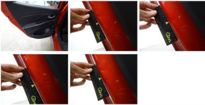
Door F R, Dent(s) and scratch(es), LI - Repair and paint (complete)