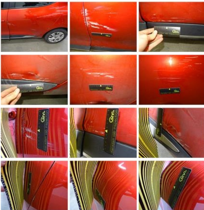
Tailgate, Dent(s) and scratch(es), Acceptable