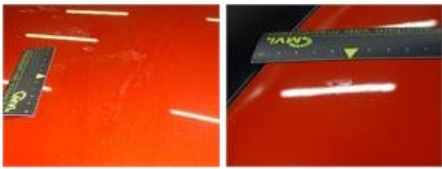
Bumper F, Dent(s) and scratch(es), LI - Repair and paint (complete)