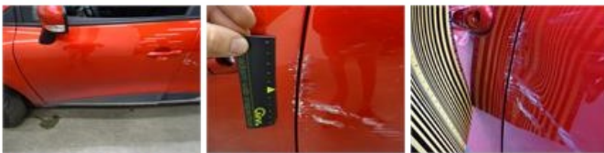
Rocker panel inner R L, Dent(s), LI - Repair and paint (complete) 115,56