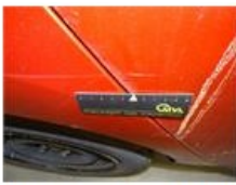
Rocker panel inner F L, Dent(s), LI - Repair and paint (complete)