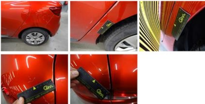
Wing R R, Dent(s) and scratch(es), LI - Repair and paint (complete) 246,56