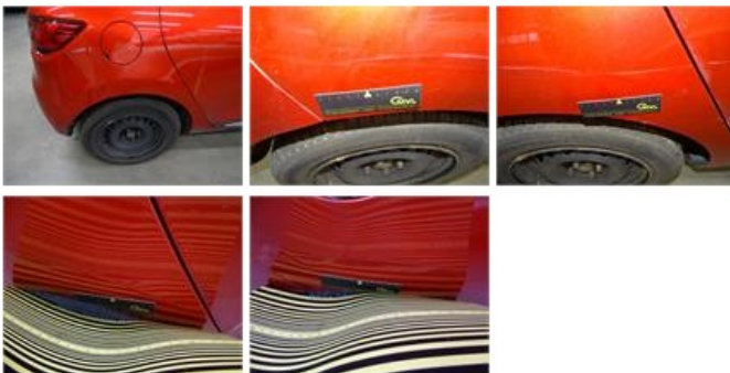
Door F L, Dent(s) and scratch(es), LI - Repair and paint (complete) 254,68