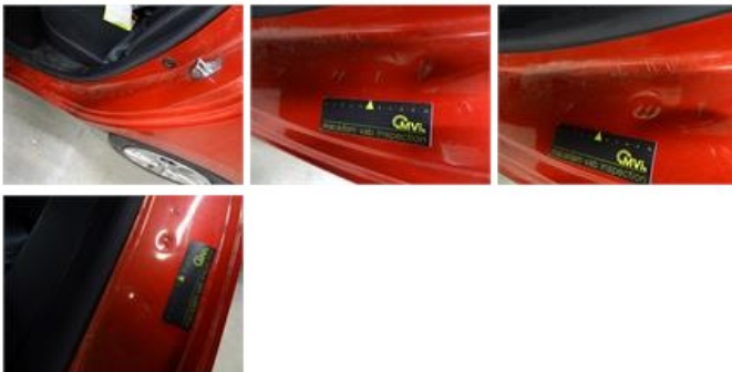
Door R R, Dent(s) and scratch(es), LI - Repair and paint (complete) 254,68