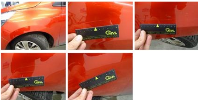
Bumper R, Scratch(es), LI - Repair and paint (complete)