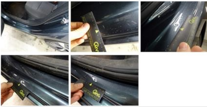
Wing F L, Scratch(es), LI - Repair and paint (complete)