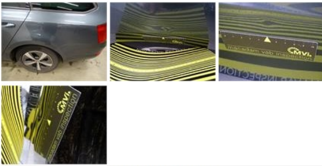
Door F L, Scratch(es), LI - Repair and paint (complete) 318,35