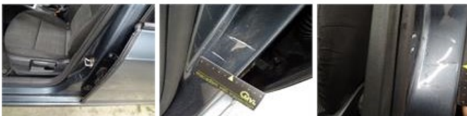
Door R R, Dent(s) and scratch(es), LI - Repair and paint (complete) 318,35