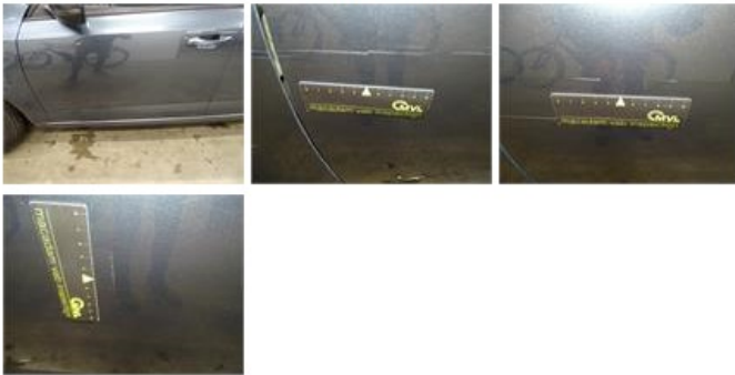
Rocker panel inner F L, Dent(s), LI - Repair and paint (complete) 115,56