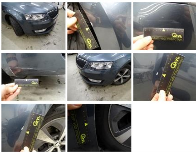
Trunk lid covering R, Scratch(es), Smart repair