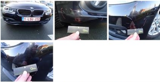
Bumper R, Dent(s) and scratch(es), LI - Repair and paint (complete)