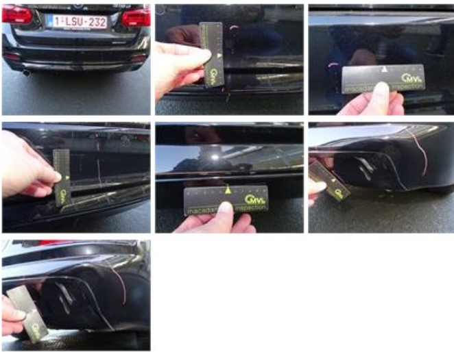
Tailgate, Scratch(es), LI - Repair and paint (complete)