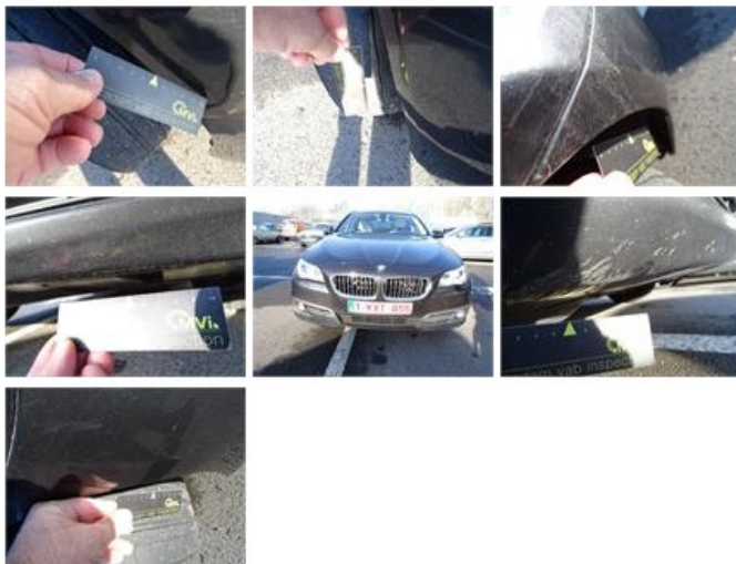
Alloy rim F L polished, Scratch(es), I - Repair