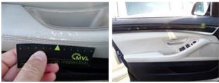
Door F R, Scratch(es), Acceptable