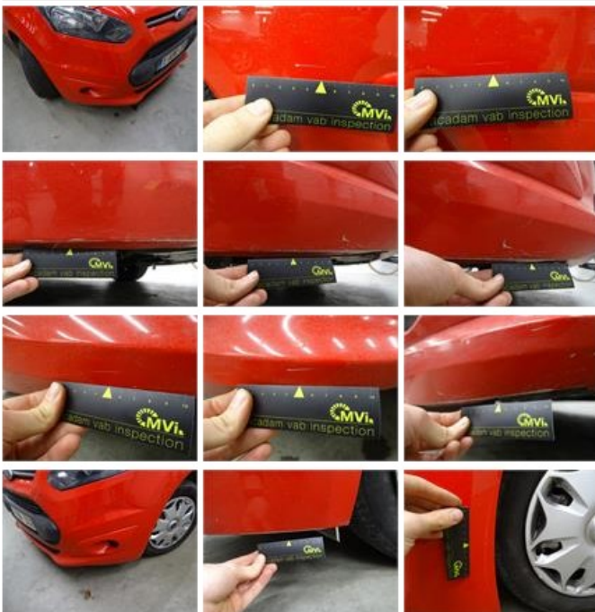
Wing F L, Dent(s) and scratch(es), LI - Repair and paint (complete)