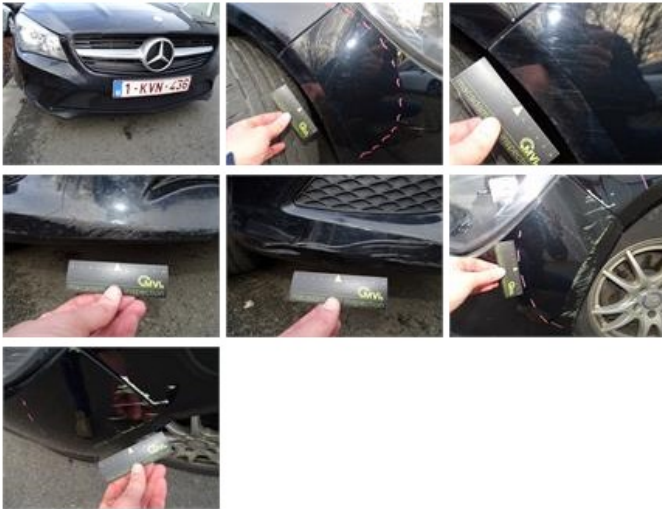
Door R R, Scratch(es), 67 - Polish