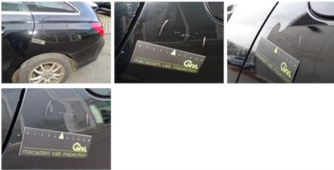
Wing F L, Dent(s) and scratch(es), LI - Repair and paint (complete)