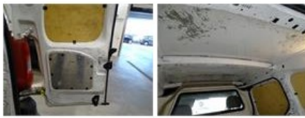
Door frame F L, Dent(s), It - Spot repair