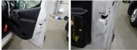
Rocker panel inner F L, Scratch(es), Forfeit