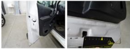
Door frame F R, Dent(s), It - Spot repair