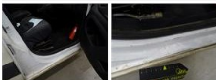
Door seal F L, Deformed / Strained, E - Replace