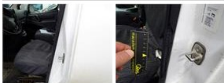
Sill outer R, Dent(s), LI - Repair and paint (complete)