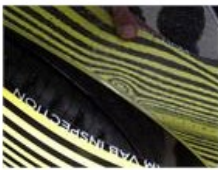
Door R L, Dent(s) and scratch(es), It - Spot repair