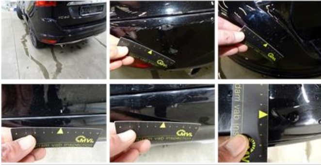
Wing F R, Dent(s) and scratch(es), Acceptable