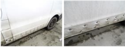
Bumper F, Scratch(es), LI - Repair and paint (complete)