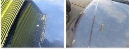
Roof, Dent(s), PDR - Paintless dent repair