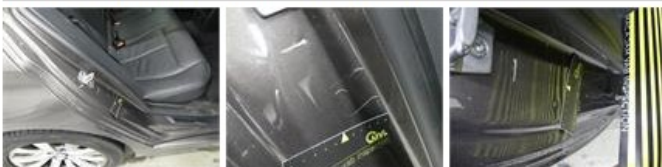
Roof, Chemical polution, LI - Repair and paint (complete)