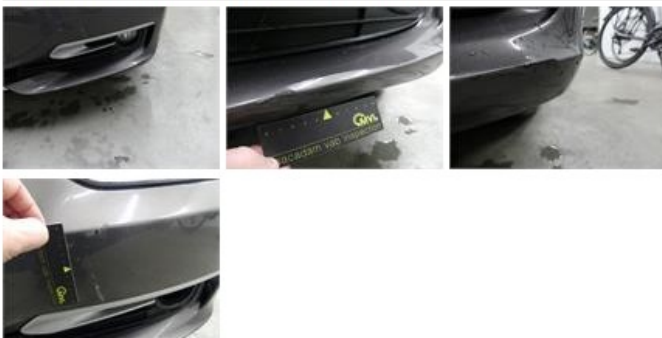
Foglight R, Broken, E - Replace