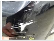
Bumper R, Scratch(es), LI - Repair and paint (complete)