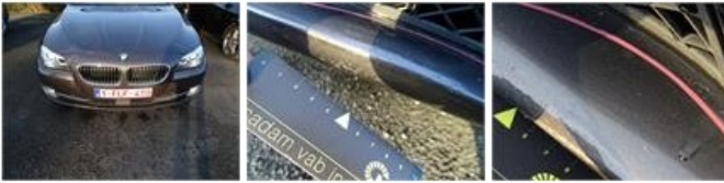
Door F R, Dent(s) and scratch(es), LI - Repair and paint (complete)