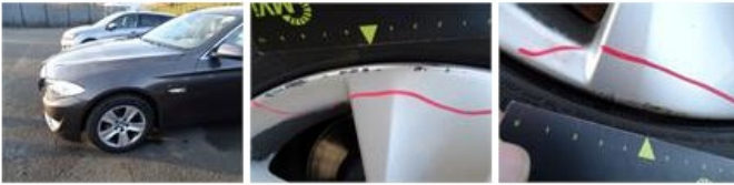
Alloy rim R L, Scratch(es), LI - Repair and paint (complete)