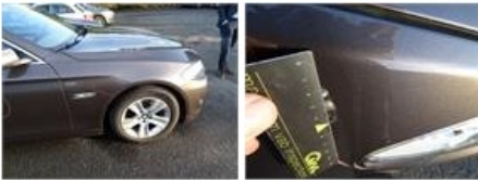
Bonnet, Chemical pollution, LI - Repair and paint (complete)