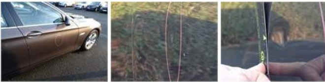
Wing F R, Chemical pollution, LI - Repair and paint (complete)