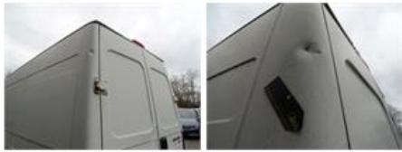
Rearlight L, Broken, E - Replace