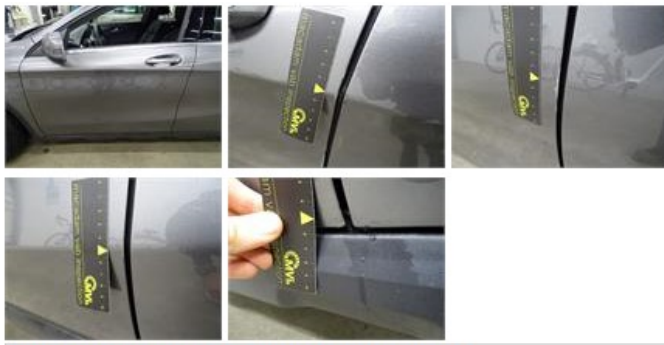
Roof, Chemical polution, LI - Repair and paint (complete)