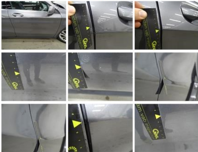
Door R R, Bad repair, Acceptable