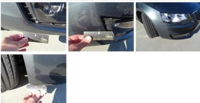
Door R R, Scratch(es), Acceptable