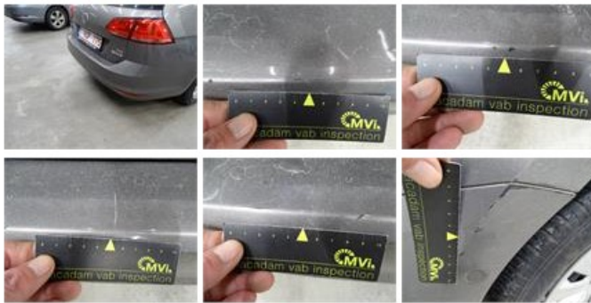
Door F R, Dent(s), PDR - Paintless dent repair