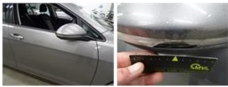
Wing R R, Dent(s) and scratch(es), LI - Repair and paint (complete)