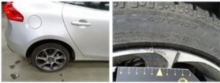
Maintenance, Maintenance, Execute