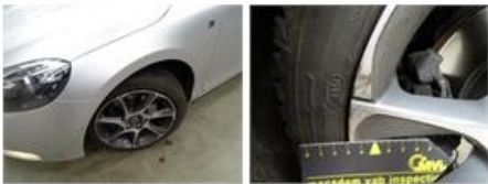
Bumper R, Scratch(es), Acceptable