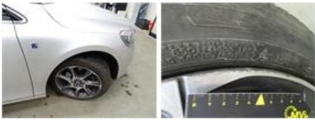
Alloy rim R R polished, Rust, Acceptable