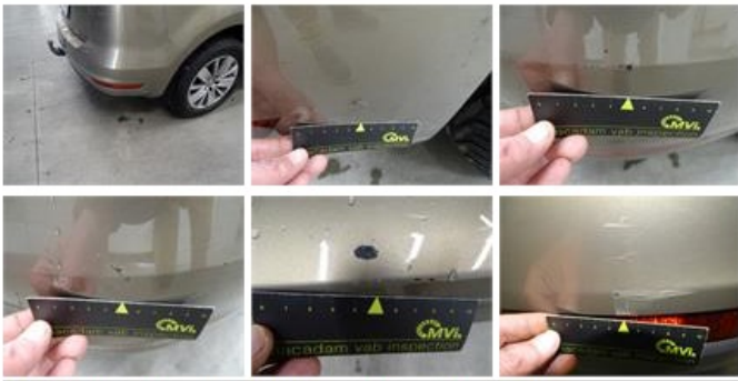
Alloy rim R R, Scratch(es), LI - Repair and paint (complete) 95,00